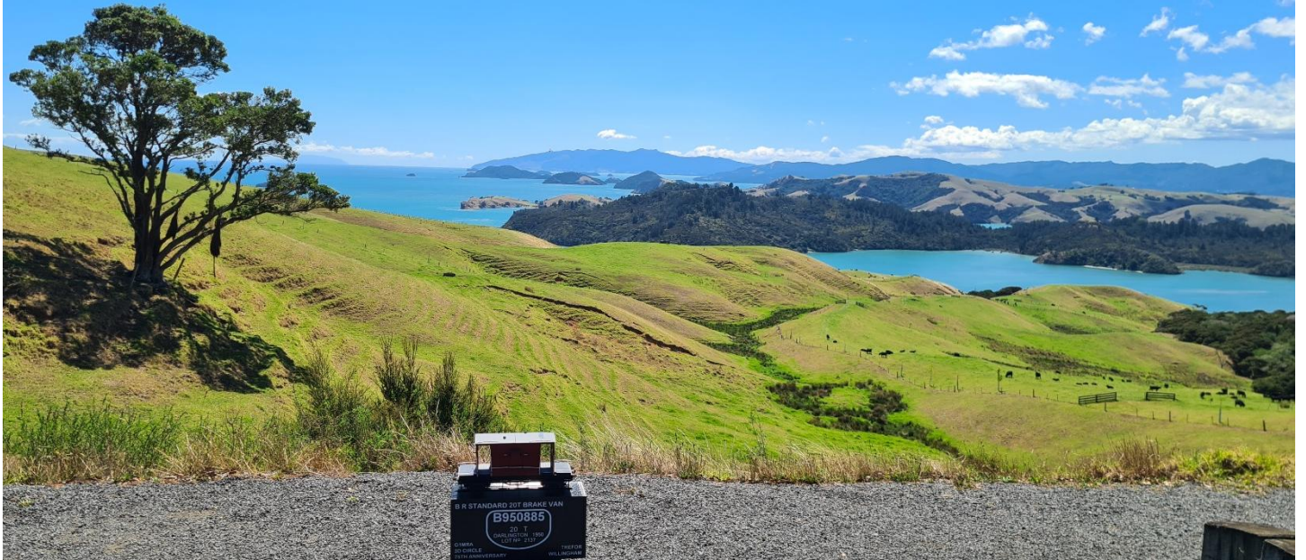
Looking north along the west coast of the Peninsular towards its far tip at Cape Colville.