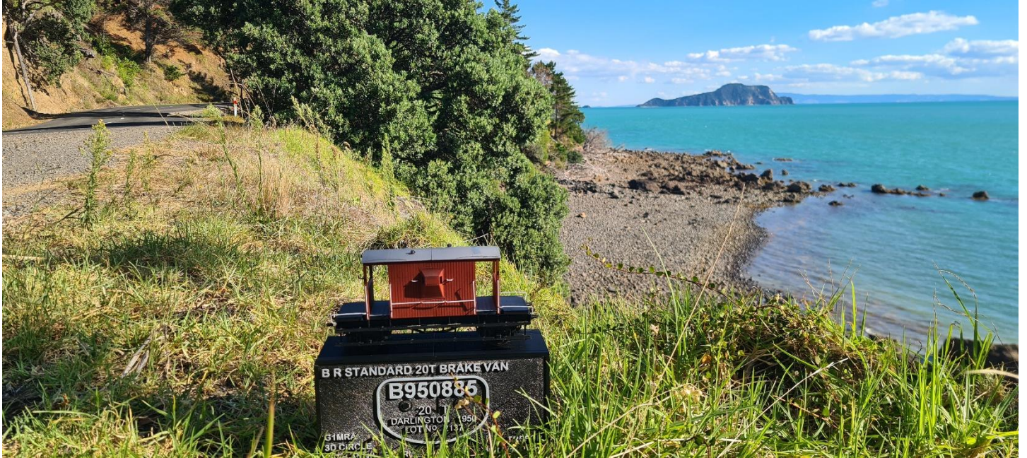
A drive around a gravel loop road saw us back on the west side still north of Coromandel township where we followed the coastline south.