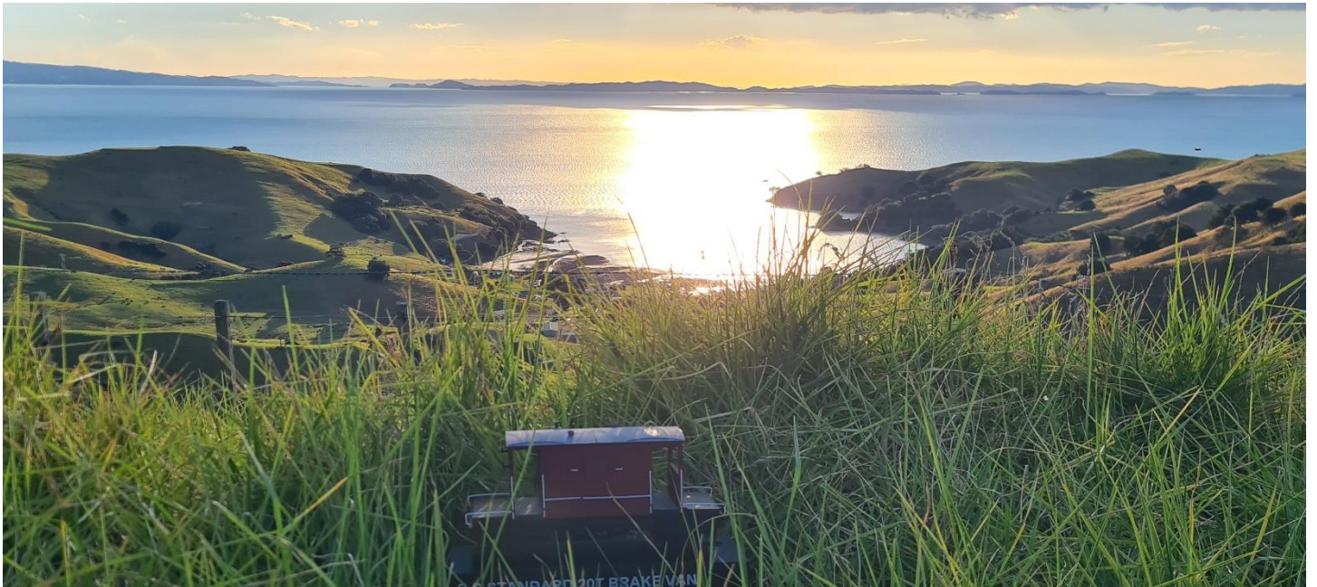
Further south, having passed through the township once again, the road climbs up around a bluff area to regain the coastline along the Firth of Thames once again. This is the view west into the setting sun looking across to Auckland.