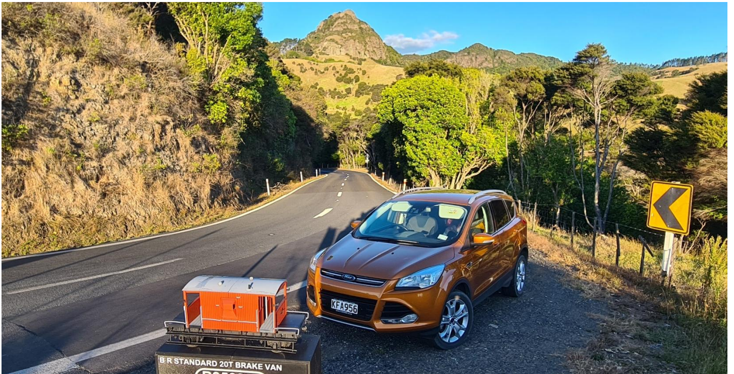
Looking south along the road close by the above view point