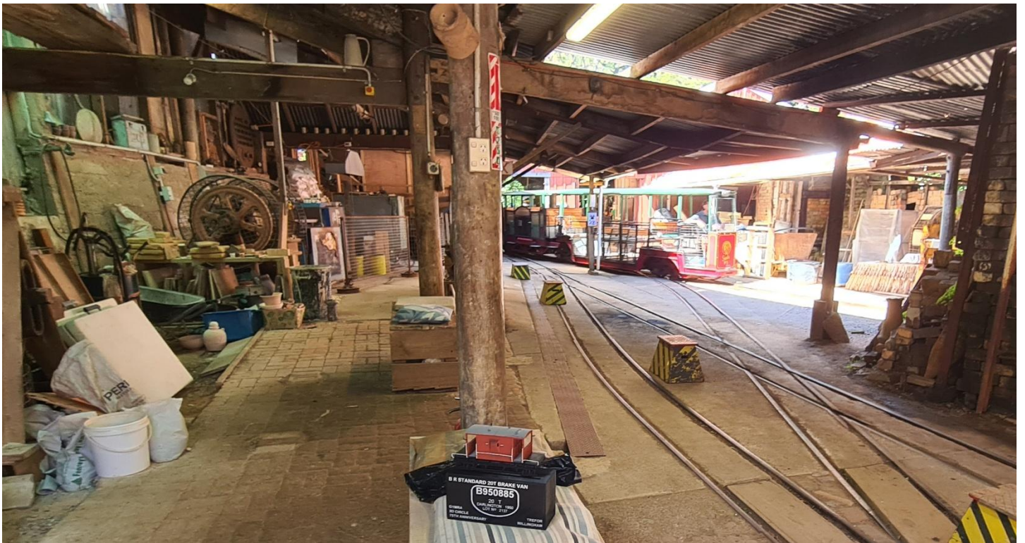
Just north of Coromandel township lies the Driving Creek Railway which we visited but weren't able to travel on. It had been block booked by a car touring club which seriously limited available seats for speculative visitors such as ourselves. Nonetheless, the opportunity was taken for a few photos. One of the railcars that operate on the railway (10.25-inch gauge) is being shunted.