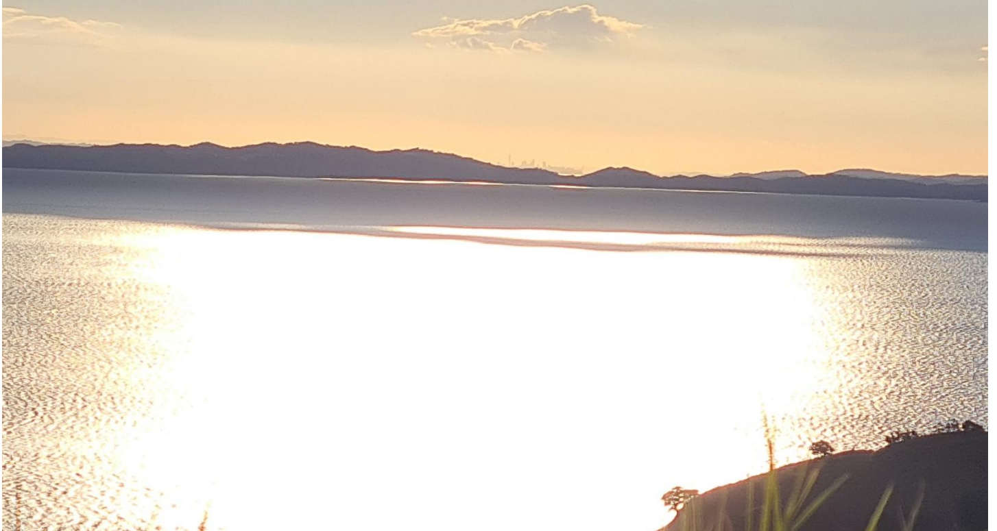
An enlarged part of the previous photo showing the tower blocks of the Auckland CBD in the distance about 90km away through a low point in the islands directly below the prominent cloud. Driving around from this location would take about 200km and about 2-3 hours depending on traffic.